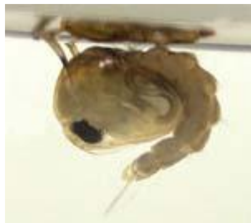
Mosquito pupa tumbler