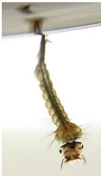
Mosquito larvae wiggler