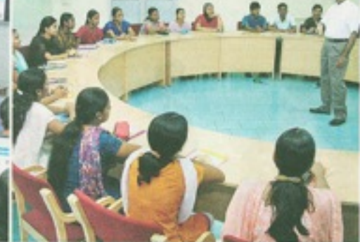
DIFFERENT CLASS, DIFFERENT EXPERIENCE: A quiet revolution is taking place in a classroom in the Tamil Nedu Agricultural University, Colimbature. An ICT (information and communications technology) - enabled classroom under way in the university. At Right, a different model of classroom, where the teacher is at the centre and nearer the students.